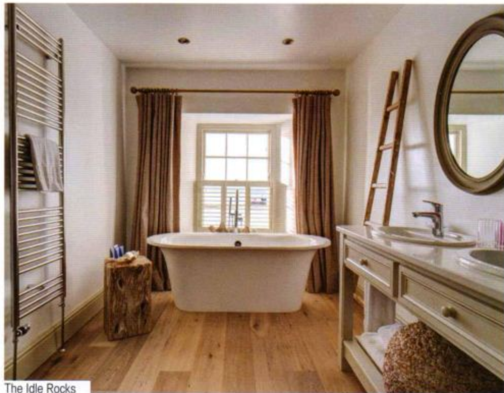
The Idle Rocks

Just two miles outside Newmarket this newly opened and renovated coaching inn brings a much needed alternative to a relaxed and informal British dining experience. With an award-winning chef at the helm the menus are full of fresh, local and seasonal produce transformed into firm favourites with a twist alongside some more unusual temptations. The eight spacious en-suite rooms at The Packhorse Inn are a welcome retreat from