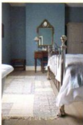
Above: La Locanda delle Donne Monache and left: The Packhorse Inn, Moulton near Newmarket

city life and make the perfect base for racegoers, shooting parties and those wanting to explore Cambridge. The Club Room, which seats up to 30, is ideal for birthdays, anniversaries and celebrations. Rates from £100 per night.