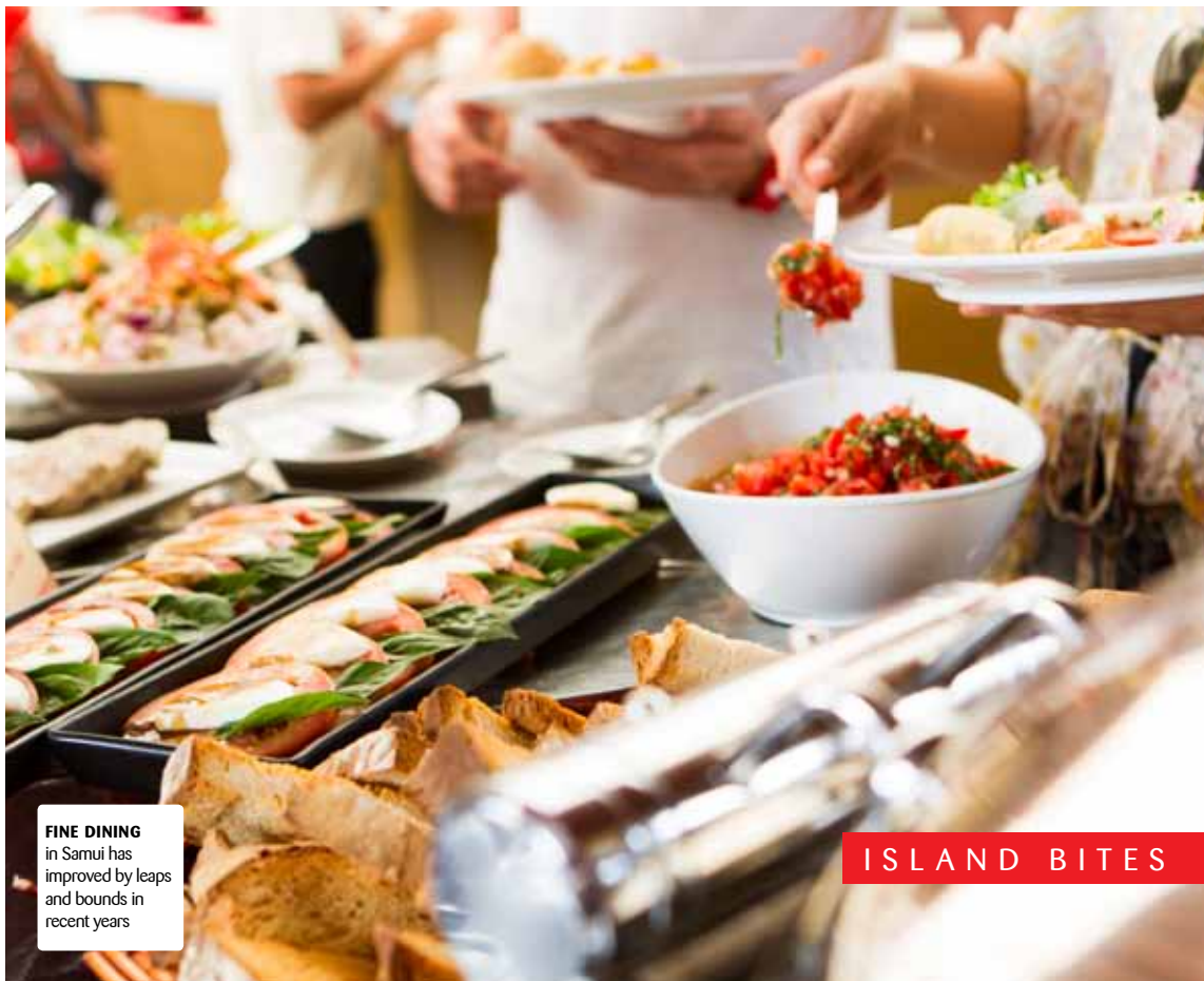
FINE DINING in Samui has improved by leaps and bounds in recent years

Choose from a near-comprehensive range of Thai dishes on Maenam Walking Street every Thursday. Alongside favourites like barbecued squid, spicy pork, mango and sticky rice, and Thai khanom (sweets), there's always a good selection of deep-fried insects to try.