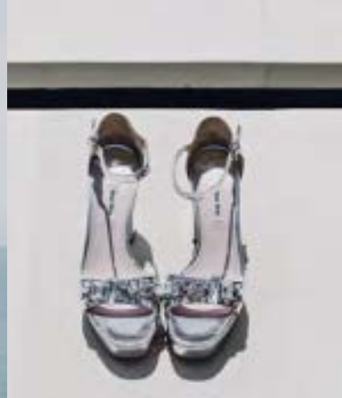
Clockwise from far left: Samujana villas; the bride's "dream" Miu Miu shoes; final prep; fan-style wedding programs; the groomsman in summer suits.