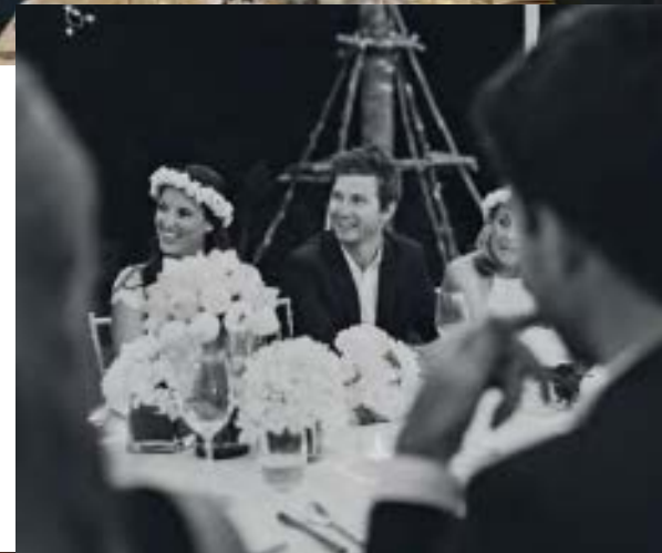
From top: toasts under a canopy of fairy lights; during the speeches; a coconut ice-cream bar in place of a traditional wedding cake.

“The couple made welcome packs for guests, including a map of the island, information on local restaurants, sunscreen and personalised sunglasses.”