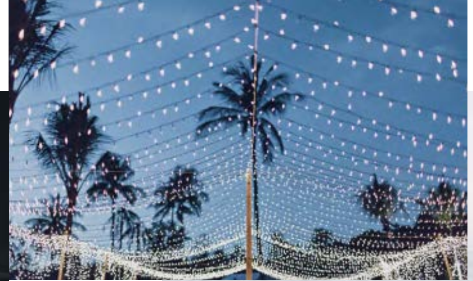
From left: the reception ended with dancing on the beach in Koh Samui; the bride wore a Monique LHuillier dress and Le Louvre veil.