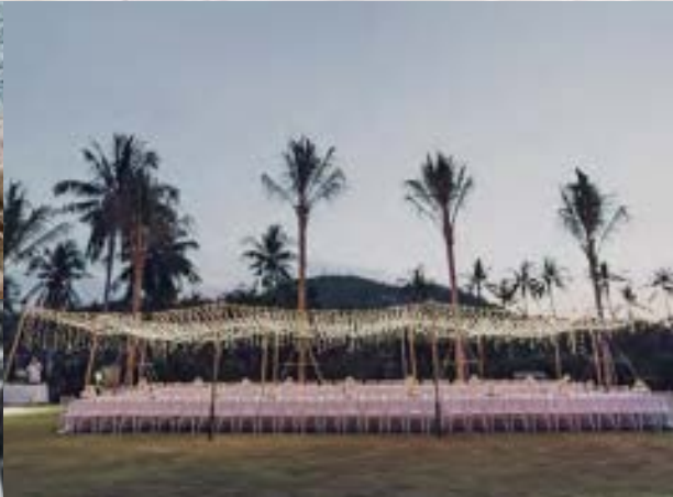
From top: the wedding took place on a grass embankment above the beach to save heels becoming sand-bound; bridesmaids in matching banana print, and all-white for the ceremony.